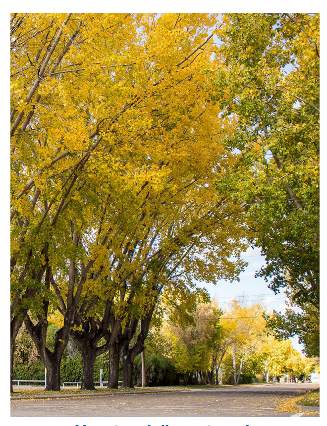
Your tax dollars at work