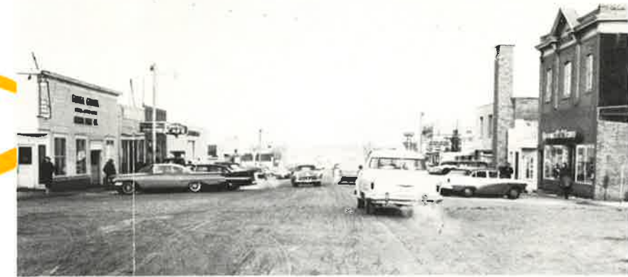
Main Street, looking north

Viking is a thriving town of over 1,000 population, situated on the crossroads of Highway 14, the main highway from the east through to Edmonton and the Yellowhead Pass, and Highway 36, which when completed will link the northern part of the province with the Trans-Canada Highway and the United States.